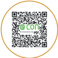
To the data sheet